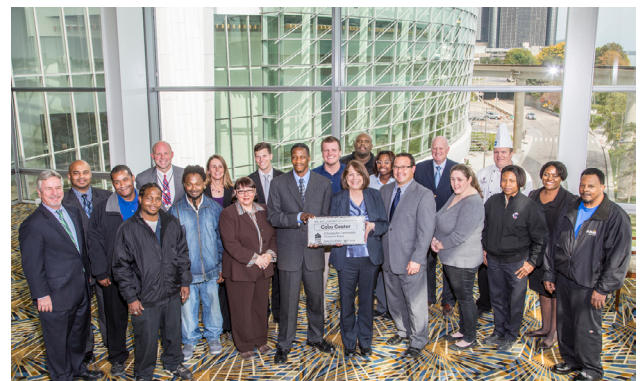
The entire Cobo Center Green Committee