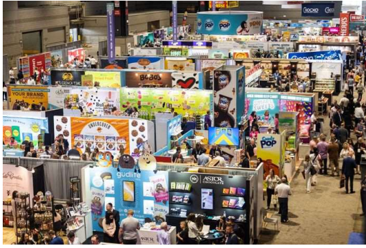
Chicago's McCormick Place was home to the 2023 Sweets and Snacks Expo.

Places like Denver and Miami rank high as cities but their convention centers rank low on the Journal's list because the venues lack the vast space and amenities of others. Some, like Cleveland's International Exposition Center, or the I-X Center, scored low in both categories.