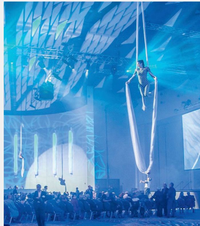
Huntington Place, Detroit