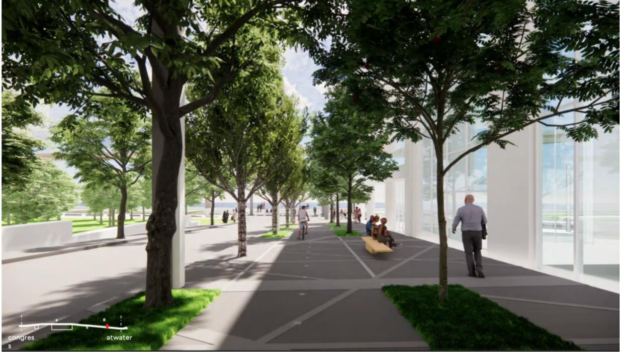
A rendering shows the proposed Second Avenue extension between Congress and Atwater streets in Detroit.

The plan calls for several types of trees to flank pathways alongside the Second Avenue extension, although some commissioners worried the trees wouldn't get adequate sunlight away from the buildings.