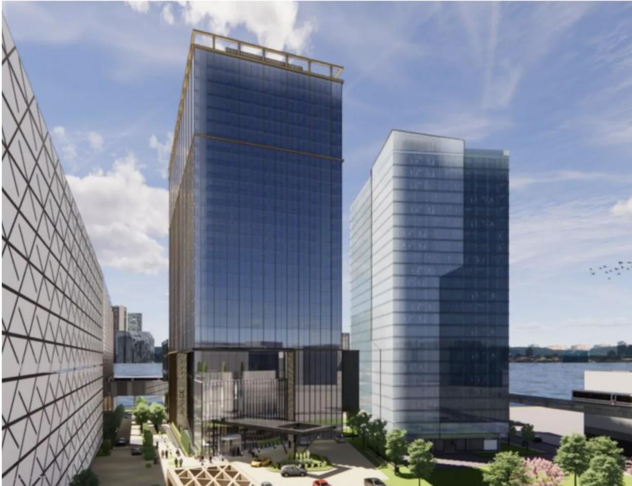
The proposed Hotel Water Square is shown in this rendering.

The hotel's developers, Atwater and Second Associates LLC, which includes Detroit-based Sterling Group as the principal, are completing work on a nearby residential project, The Residences at Water Square, set to open for tenants in February 2024.